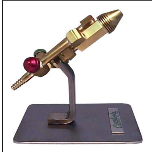
Mini CC with Hose Barb Adapters 10A041-0000

Consumption based on standard usage is approximately 1.5 LPM (Liters Per Minute) of propane and 7 LPM of oxygen. This burner may be used with oxygen and either natural gas, propane, or even hydrogen. The recommended operating pressures are 2 PSI (Pounds per Square Inch) for fuel gas and 5 PSI for oxygen.