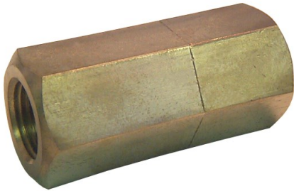
C-80 Fire Check 18A002-0000