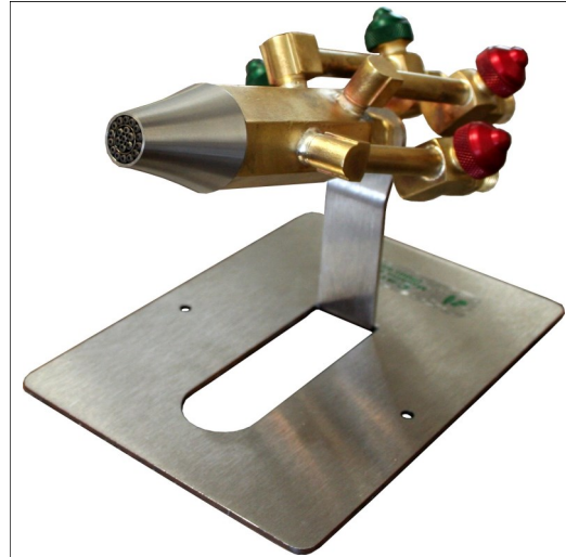
Hellcat with "B" Fittings 10A047-0100

The Hellcat also supports "The Crowley Marver." Originally introduced on the Mini CC, it is the most versatile marver on the market. The marver pad also supports The Weaver Perfect Tool System of graphite molds that mount right onto the marver to increase your productivity.