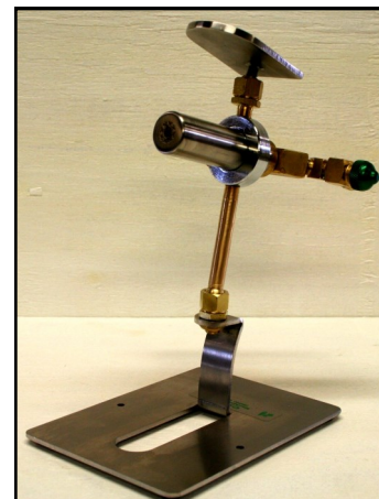
Lucio Burner w/ stainless porous marver and Limited Edition Base

Designed to meet the needs of the professional soft glass fameworker, the Lucio Burner is the premier torch for sculpting in soft glass. Using low pressure fuel gas and oxygen, this torch provides a soft, wide flame, that promotes less stress in the glass, helping to avoid cracks and allowing the artist to work larger projects.