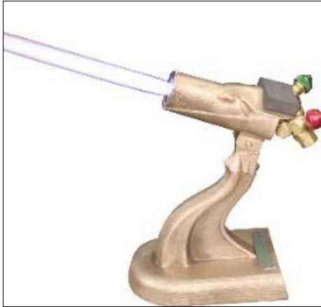
Lucio Burner with Dragon Casting 10D001-0100