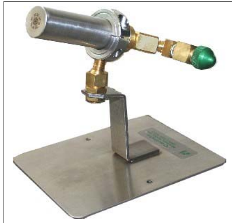
Lucio Burner with no Casting 10D002-0100