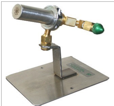
Lucio Burner On Mini CC Base 10D002-0100 Approx. 6075 Btu's @ 2 psi.