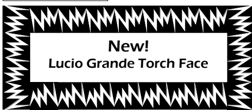
New! Lucio Grande Torch Face