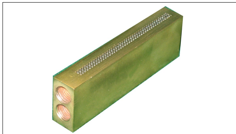
4" SMT 148 2 Row Brass Burner 11B402-0400

The SMT 148 Style Burner is capable of producing approximately 11,000 BTU/hr. per inch. This figure is doubled and tripled for two and three rows respectively. The 148 Style is offered in sizes ranging from a 0.5" flame space to a 6" flame space. It is important to note that flame space does not reflect the burner's overall length.