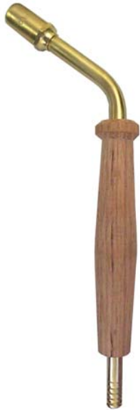
258-N Single Fire Tipping Torch with 0 tip 22D007-0000