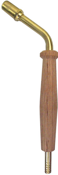
258-N Single Fire Tipping Torch with 0 tip 22D007-0000