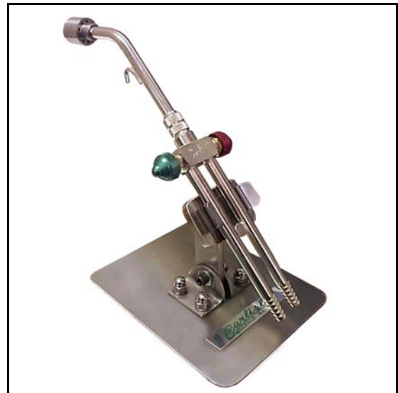
Universal Bench Stand 22B018-0000