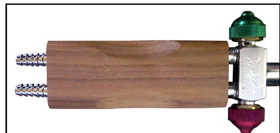
Universal Ergonomic Wooden Handle 22B025-0000

Carlisle Machine Works, Inc., P.O. Box 746, 412 S. Wade Blvd., Bldg. #5, Millville, NJ 08332 Phone: (856) 825-0627 Fax: (856) 825-5510 Web Site: www.carlislemachine.com E-Mail: carlisle@carlislemachine.com Toll Free In Continental US (800) 922-1167