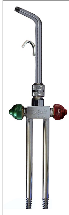
Universal Hand Torch with 3/8" Nozzle 22B006-0000

The Universal Bench Stand is an additional option. This allows the Universal Hand Torch to be set into a clamp that holds the torch by the feed tubes and at an angle so that the Hand Torch may be used as a bench burner. The clamp arm has versatile articulation for effective positioning of the torch. The lightweight Bench Stand should be secured to the bench top.