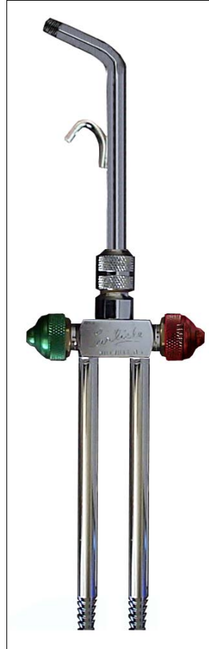
Universal Hand Torch with 3/8" Nozzle 22B006-0000

The Universal Bench Stand is an additional option. This allows the Universal Hand Torch to be set into a clamp that holds the torch by the feed tubes and at an angle so that the Hand Torch may be used as a bench burner. The clamp arm has versatile articulation for effective positioning of the torch. The lightweight Bench Stand should be secured to the bench top.