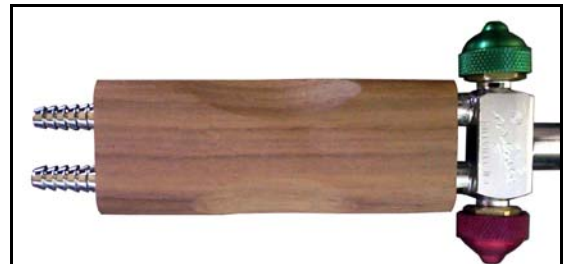
Universal Ergonomic Wooden Handle 22B025-0000

Carlisle Machine Works, Inc., P.O. Box 746, 412 S. Wade Blvd., Bldg. #5, Millville, NJ 08332 Phone: (800) 922 - 1167 Fax: (856) 825 - 5510 Web Site: www.carlislemachine.com E-Mail: carlisle@carlislemachine.com