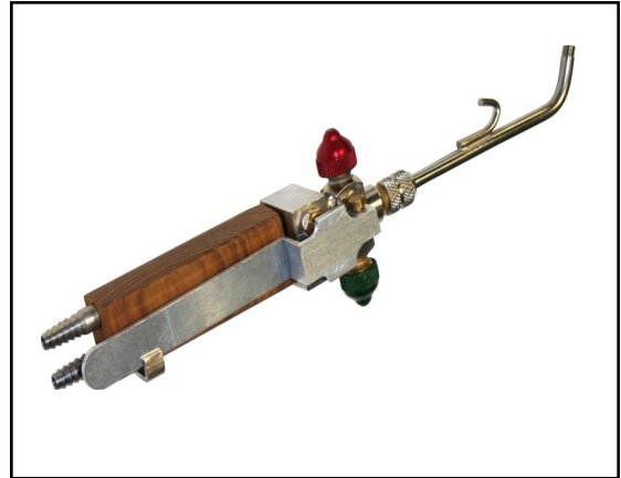
Unecon Hand Torch 22A001-0000