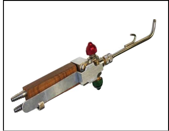
Unecon Hand Torch 22A001-0000