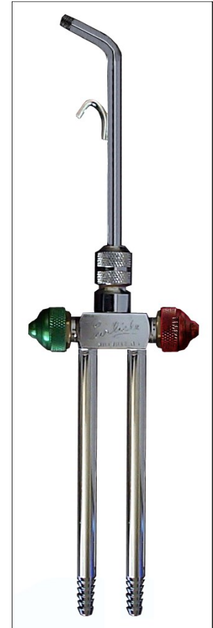
Universal Hand Torch with 1/4" Nozzle 22B006-1000